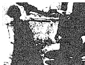
Bonnie & Clyde - A History In Images